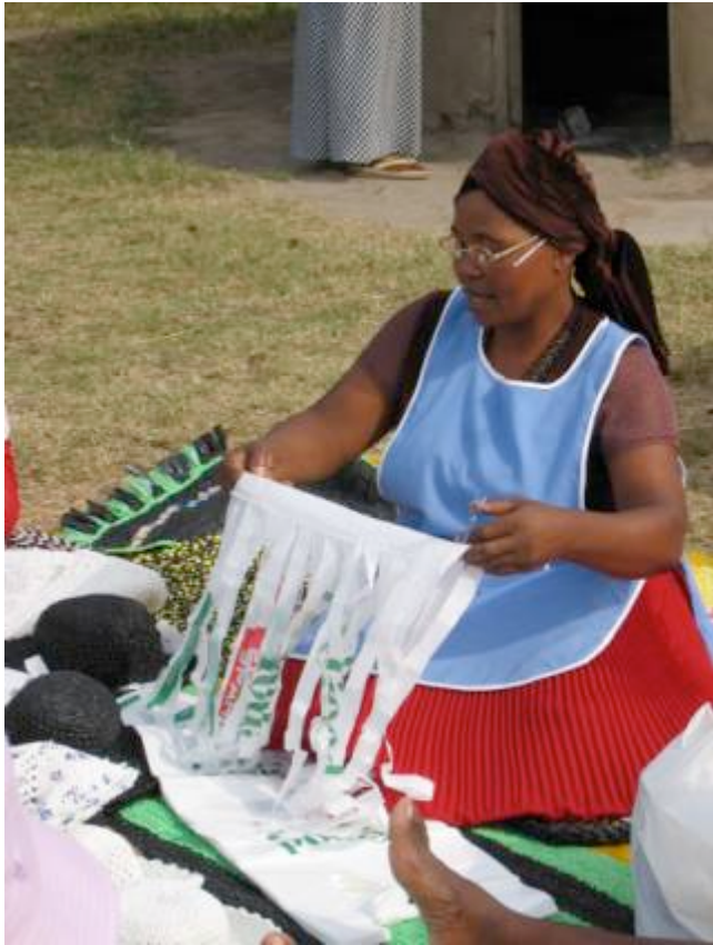
Weaving plastic bags

These items link to the Primary National Curriculum Geography KS2 5a, b; 6 b, c, e; 7 b and PSHE KS2 2 j,e