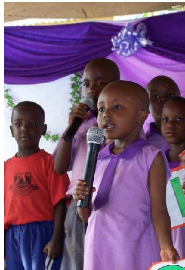
Primary school poetry performance PACE in Uganda

Read about about pollution in rivers in the Africa. What kinds of things might a fish have to deal with in a UK river (see www.waterpollution.org.uk )? Write stories as suggested, either for a UK or African river.